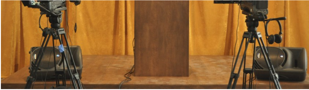
Tania Bruguera, Tatlin's Whisper #6 , 2009. Installation view, Tania Bruguera: Talking to Power / Hablándole al Poder , Yerba Buena Center for the Arts, 2017.