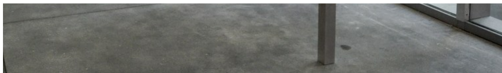
Tania Bruguera, Arte Útil Archive, 2013–ongoing. Installation view, Tania Bruguera: Talking to Power / Hablándole al Poder, Yerba Buena Center for the Arts, 2017.