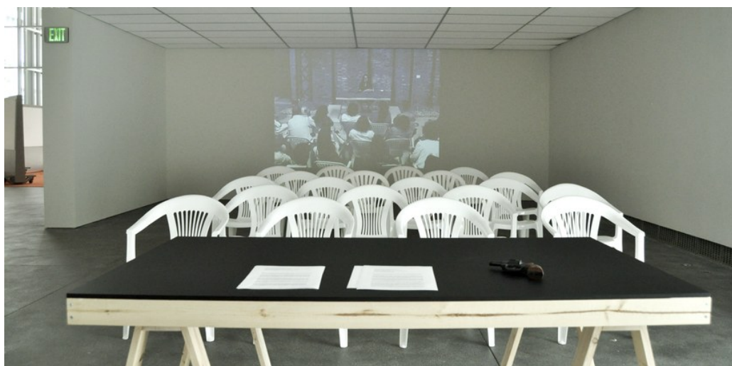
Tania Bruguera, Self-sabotage, 2009. Installation view, Tania Bruguera: Talking to Power / Hablándole al Poder, Yerba Buena Center for the Arts, 2017.

By exploring the relationship between art, activism, and social change, Tania Bruguera creates proposals and aesthetic models for others to use and adapt. Her performances are divided into short-term actions – single events and political gestures – and long-term projects that go beyond representation to create democratic institution and platforms. In collaboration with the gallery, the artist will update these projects in order to reflect the current political climate and further build on the core concepts that permeate her work. One of the central questions of the show will be of how to present social and participatory processes in the display context of an art gallery. Additionally, the exhibition will initiate the newly commissioned project Escuela de Arte Útil (School of Useful Art) , a fully functioning school held inside YBCA's galleries. Classes will be open to the public during open gallery hours.