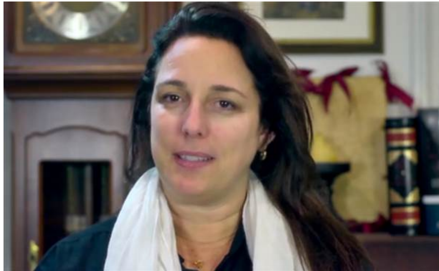
Artist Tania Bruguera.

President Obama has completed his historic three-day trip to Havana, an event that shifted the dynamics of the two countries' relations. But for those who want to be part of a new and pluralistic Cuba, this is when the work begins. Internationally renowned Cuban artist Tania Bruguera wants to make sure they have the right tools.