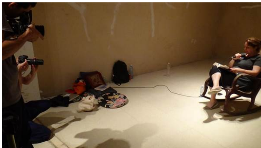
Artist Tania Bruguera.

The Cuban government has a long history of creating and co-opting institutions that belong to civic society. Unions defend the employer instead of the employee, it's a perversion. Accountability meetings in town halls praise people in power whether they have done their duty or not. Groups that call themselves civil society work for the government and I could go on and on.