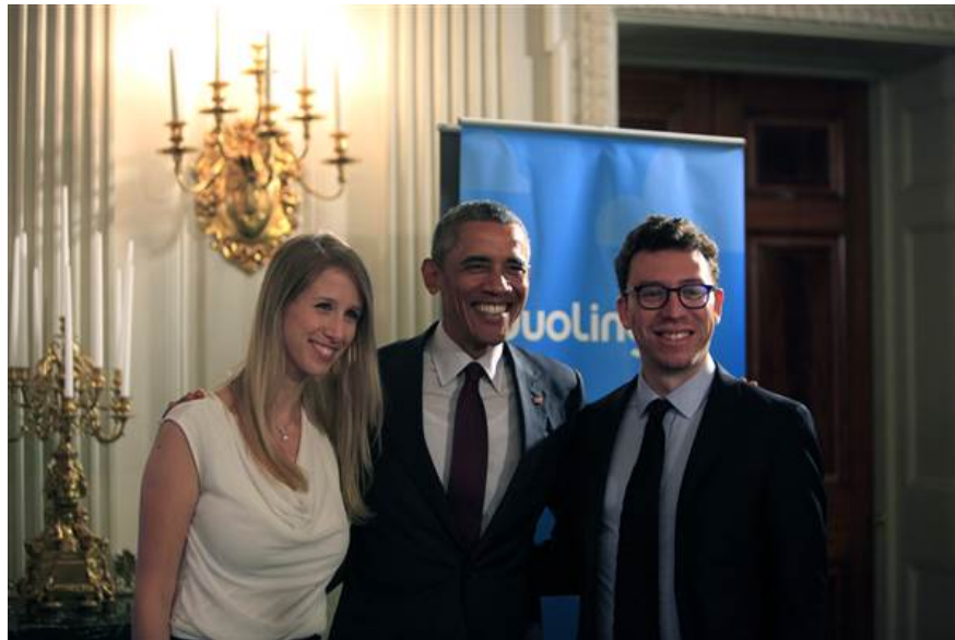
Duolingo co-founder Luis von Ahn poses for a photo at the White House with President Barack Obama.

"What makes me proudest about Duolingo, in particular, is Duolingo is used by this huge spectrum of people. On one side we have very, very wealthy users, for example, Bill Gates uses Duolingo to learn French. Tom Hanks uses Duolingo or Zoe Deschanel," von Ahn said.