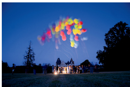
( /art-culture/domaine-de-boisbuchet-not-your-average-design-residency ) Art & Culture