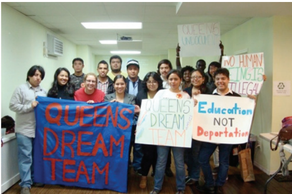
Queen's Dream Team, Immigrant Movement International. October 2nd. 2011.

In IMI, Bruguera calls for 'immigrant respect,' 'immigrant rights', and the achievement of an 'international citizenry.' [17] The work consists of a headquarters in Corona, Queens where community building under the masthead of 'everyone is an immigrant' occurs. Legal and social services, promotion of political participation for legal and illegal immigrants, and English literacy programs run by artists all occur through the center. With Immigrant Movement, Bruguera is rallying the call for a genre of social practice titled 'Useful Art', or arte util . To quote, "the way it operates is dictated by the practical impact of its strategies." [18] I have also chosen to discuss Bruguera because her definition of 'useful art' establishes a distinct genre within the expanse of social practice that can be taken up by critical legal theory. 'Useful Art' becomes set of characteristics, which defines a genre of social practice transhistorically: it is work that is not only relational but intervenes politically. Its "utilitarian assertion" is productively considered under a Left legal critique, which accepts no universal claims of use-value, even automatically distrusts such affirmations as counter-productive. To be sure, the universalisms of rights, as Brown and others have illustrated at length, serve to conceal and facilitate existing power hierarchies.