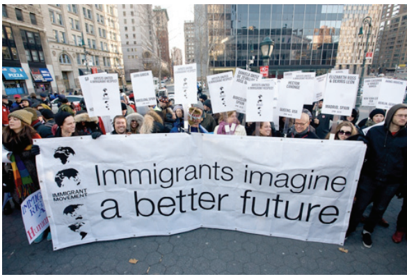
Immigrant Movement International.